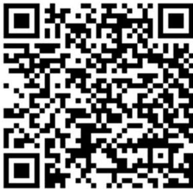
Google QR Code